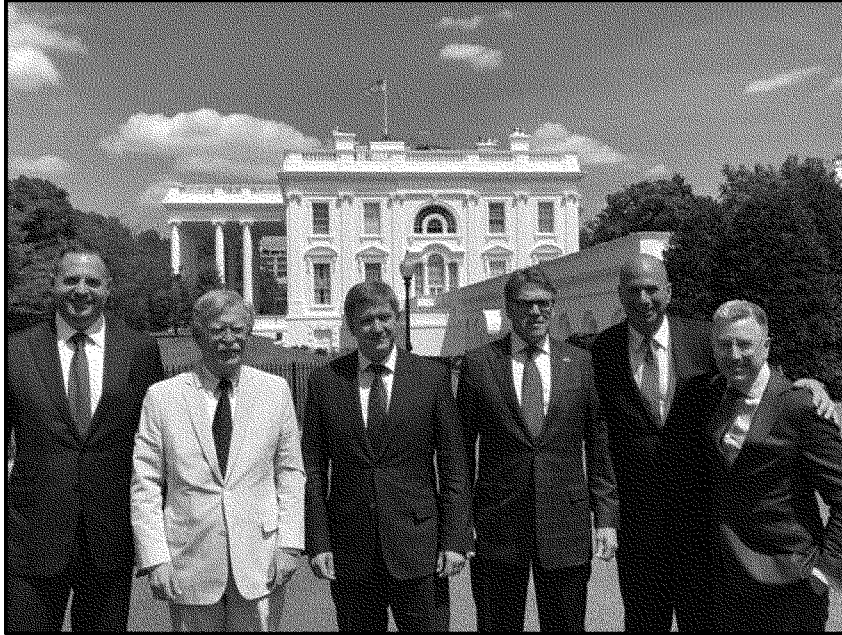
Figure 2: Picture of smiling U.S. and Ukrainian officials following July 10 meeting