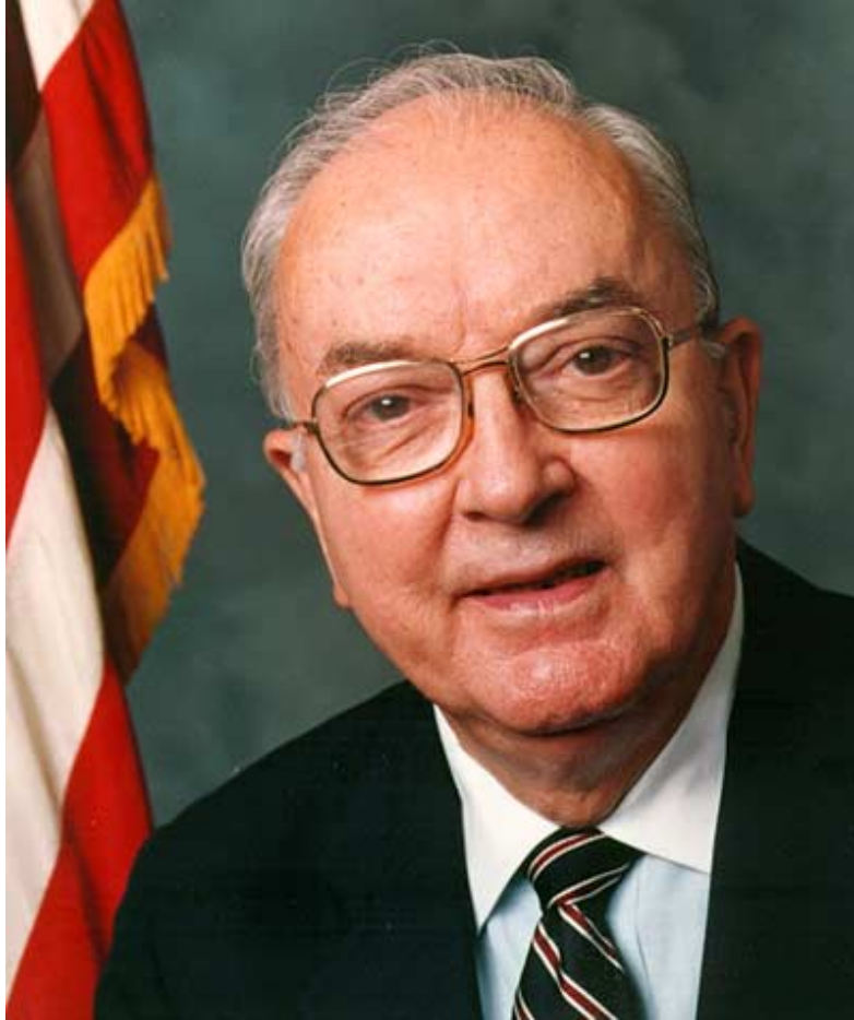
SENATOR JESSE HELMS OF NORTH CAROLINA, CHAIRMAN