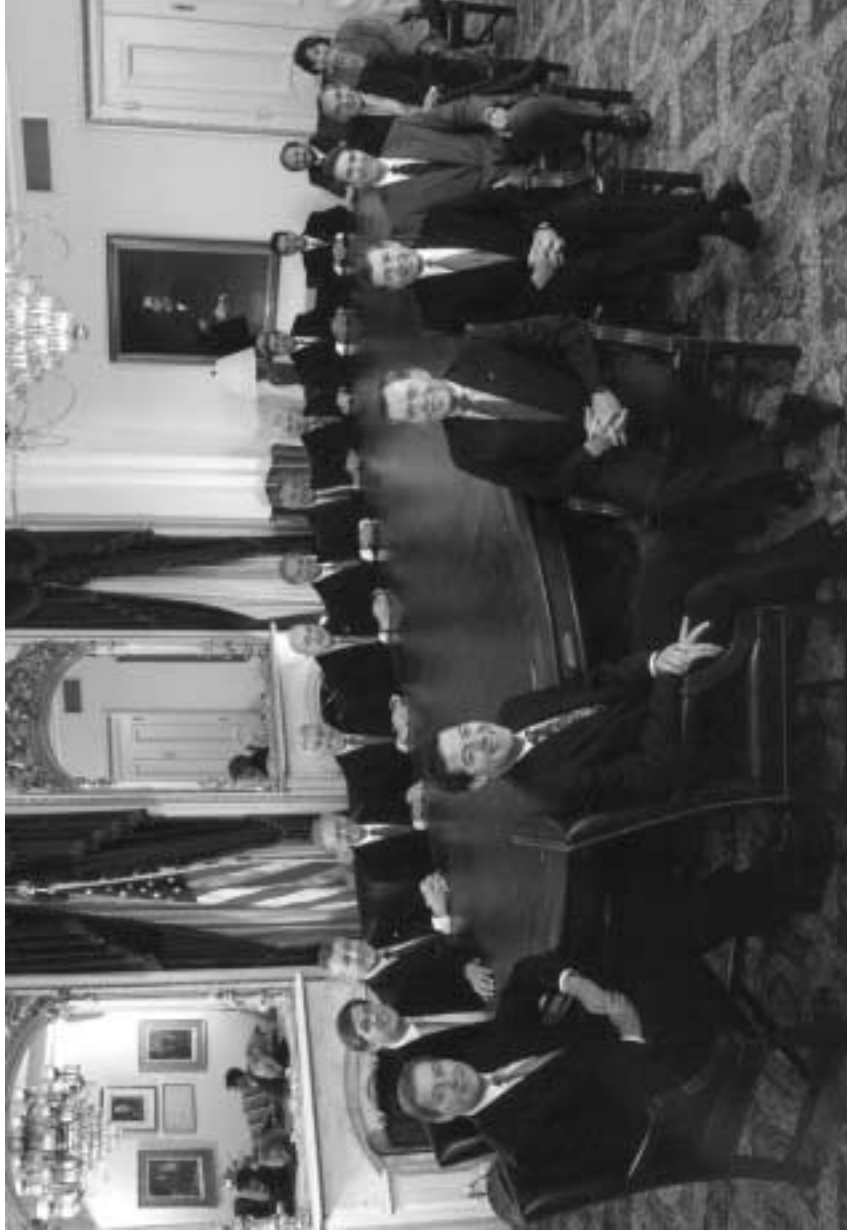
UNITED STATES SENATE COMMITTEE ON FOREIGN RELATIONS, FIRST SESSION, 106TH CONGRESS