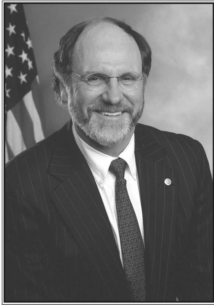
Jon S. Corzine