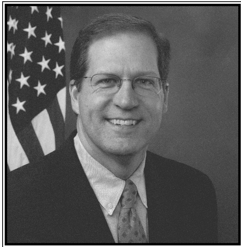
John E. Sununu