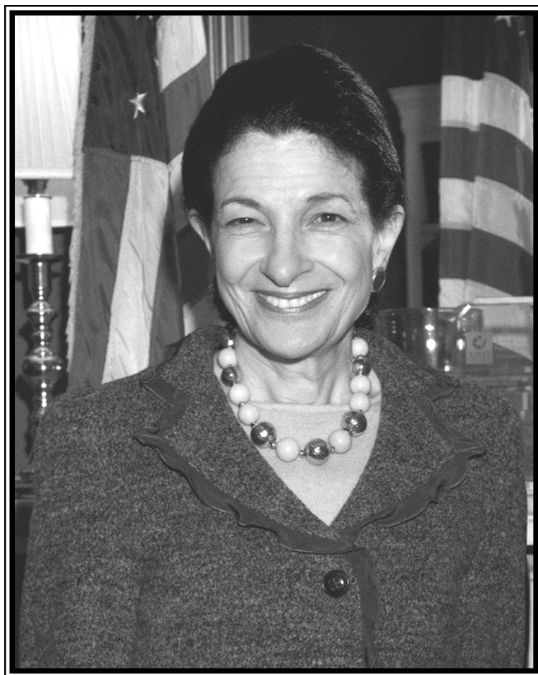
Olympia J. Snowe