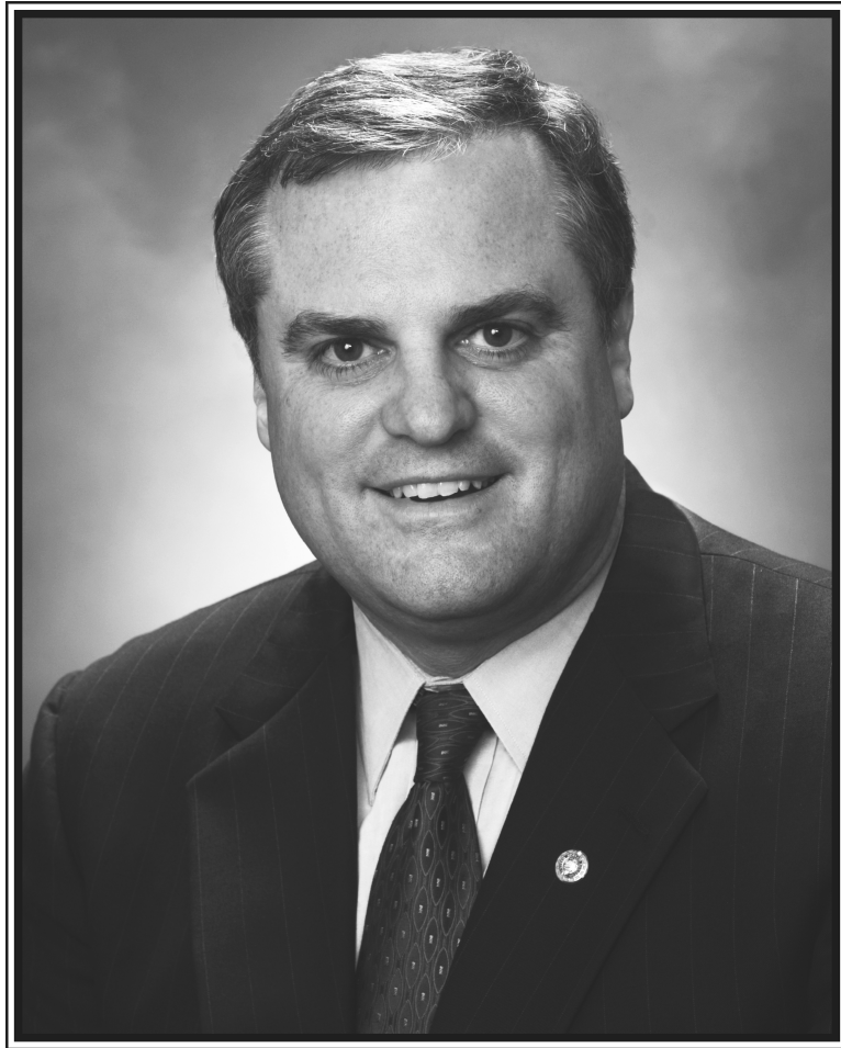
Mark L. Pryor