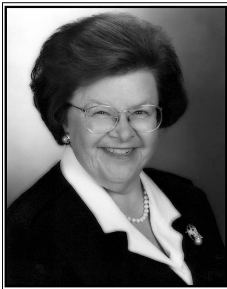
Barbara A. Mikulski