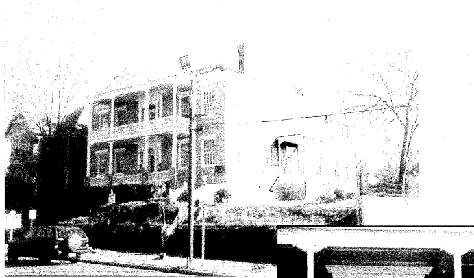
Front view, Pemberton's Headquarters, also known as the Willis-Cowan House. The house has fine Greek Revival details, such as the classical columns (see detail right) flanking the front doors on both stories.