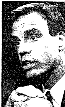
Gov. Mark R. Warner said universities may have to live with fewer courses and larger classes to help make up a $2 billion state budget shortfall.

That was the knee bright spot today, as Warner used yet another public forum to outline the stark realities of impending budget cuts. He noted that, like every other state agency, individual colleges