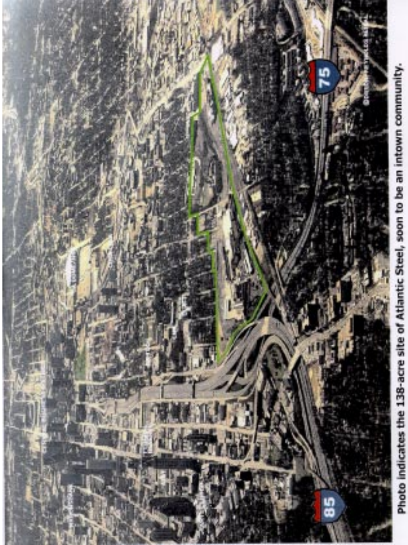
Photo indicates the 138-acre site of Atlantic Steel, soon to be an intown community.