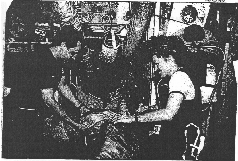
A great deal of information on human health on long-duration spaceflights is being derived from Shannoo Lucid's record-breaking 188-day stay aboard the Mir space station.