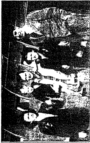
THE SENATORS OF MARYLAND (LEFT), VIRGINIA (MIDDLE), GEORGIA (RIGHT), AND SOUTH CAROLINA (FAR RIGHT) AT THE CONSTITUTIONAL CONVENTION OF 1787.

is a former director of research for the House Committee on the District of Columbia.