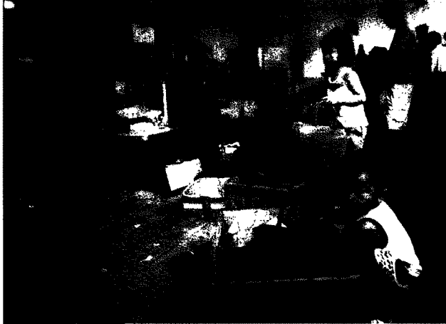
Among the estimated 60,000 Chinese now living in Italy, legal and illegal immigrants have been found laboring side by side with slaves. Investigations of immigrant workplaces—like a leather factory near Florence—are often stymied by language barriers and the widespread use of fraudulent identity documents.

by smuggling gangs to take people across: up from an average of about $1,000 a person to $2,000. Survivors of the journey arrive deeply indebted and vulnerable to slavers.