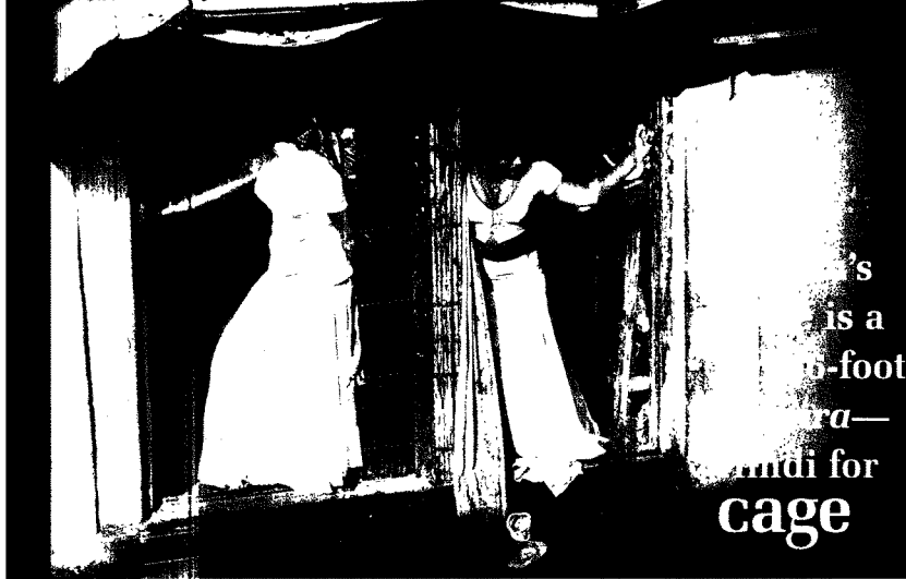
Brothels line Falkland Road in Mumbai, with the youngest, prettiest women displayed in street-level cages to attract customers day and night. Many women are delivered into these ramshackle hives by traffickers; many others are sold outright by parents or husbands.

at the idea and took up his offer to drive her there, through Romania. "But when I realized we had driven west, to the border with Serbia, I knew something was wrong."