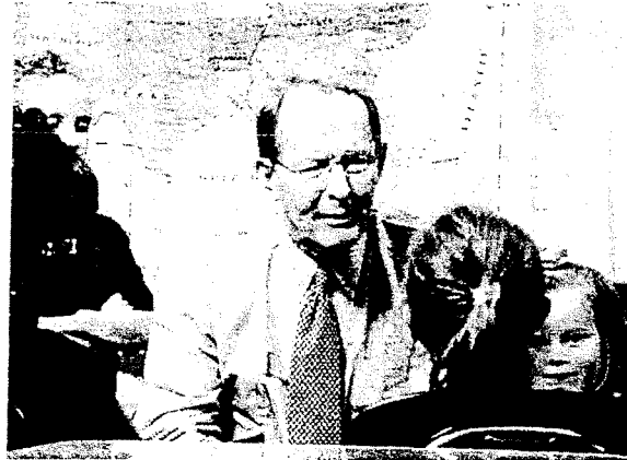
"Enacting Pell Grants for Kids should be the next central thrust of federal efforts to improve the nation's schools," writes Senator Alexander, who served as secretary of education in the George H.W. Bush administration.