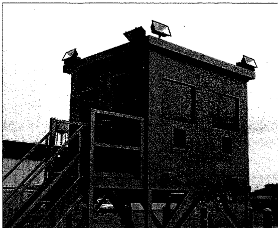
Figure 1: Example of a Bullet-Resistant Structure