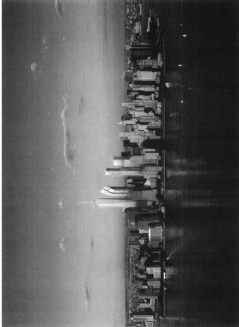
The Future Skyline of Downtown New York