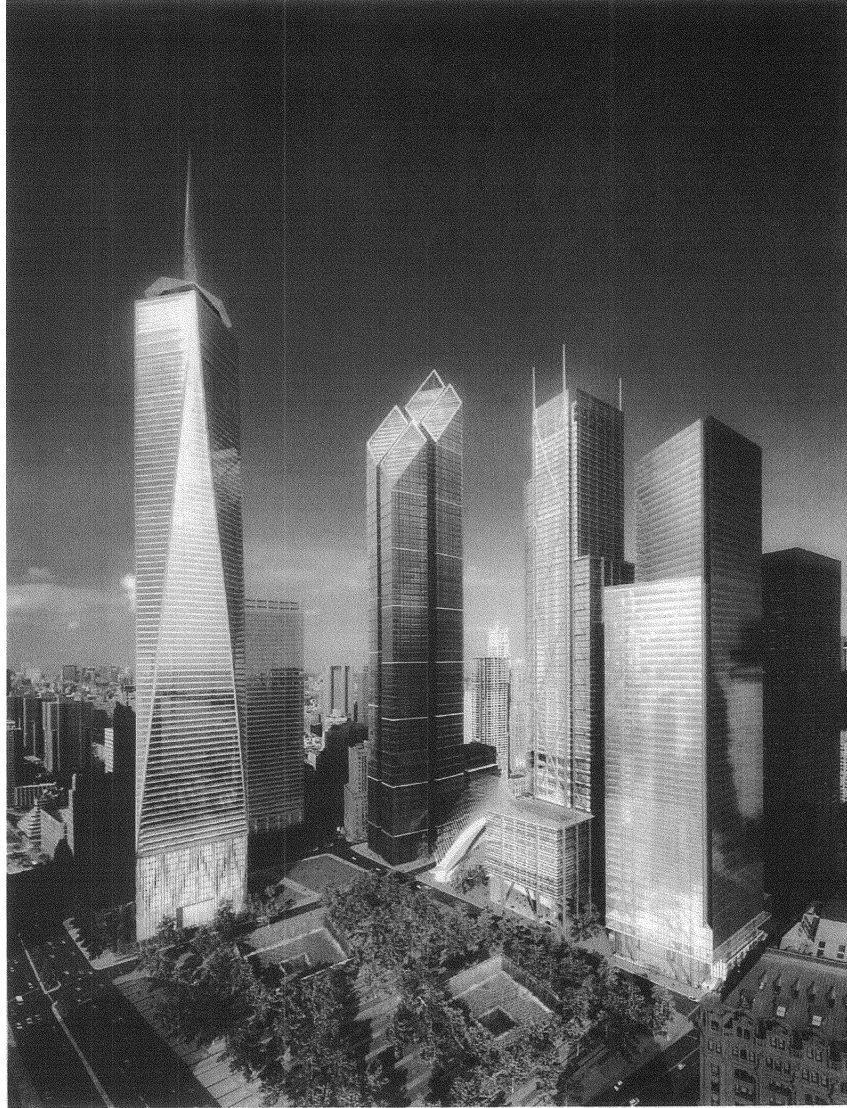
Day View of the World Trade Center