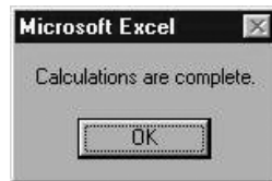
Figure 4–3. Calculations Complete Indicator

Depending on the processing speed of the computer, the calculation may take more than a minute to finish. The worksheet will display the message shown in Figure 4–3 when the calculation process is complete. Wait for this message before continuing with other operations in the workbook.