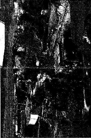
This is where the girls come from: villages like these throughout Nepal.