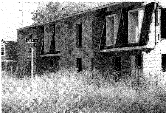
Figure 2: Replacement Street Signs Facilitated Address Canvassing in New Orleans