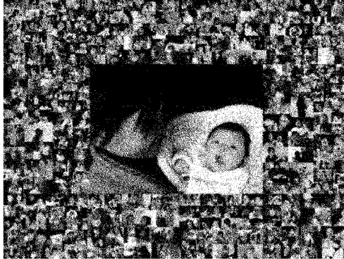
A sampling of the baby girls and families who have received aid through All Girls Allowed's Baby Shower program.

agents to record the aid distribution by video. (In order to protect the personal safety of our workers, we will not identify the specific location.) These agents followed the AGA workers on their visits to families in remote villages, recording the conversations between our workers and the beneficiary families. While AGA workers and local families were talking at the doorstep, they stood nearby. When our workers entered local houses, the police would enter and sit down as well. One may well imagine the anxiety and oppression felt by the AGA workers and rural families. Some families requested to stop receiving aid in order to escape police attention, fearing that the attention would have long-lasting ill effects on the entire family. Many volunteers also decided to stop contributing their time to this charitable program. They had volunteered with AGA to serve the local community, but found themselves treated as suspected felons under open police surveillance. Neighbors of AGA workers also became suspicious and began opposing their work.