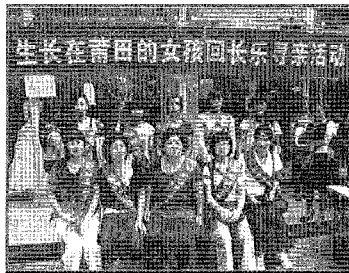
Child-bride victims in Fujian organized a campaign to find their families.

In the 1980's and 1990's, rural families in this city had seven to eight children on average. The number could be even higher now. Over a quarter of the children were bought. Based on estimates taken from police reports as well as government census data, the city's child-bride population is estimated to range between 120,000 and 600,000. Even the lower estimate is shocking for a city of just over three million inhabitants. This number represents the suffering of 120,000 families and the sorrow of 120,000 girls and young women who lost their precious freedom. Unfortunately, local authorities have turned a blind eye to the problem--or worse, they have been complicit in the crime. All Girls Allowed is working with the media to expose this tragedy and to bring hope for these child-brides.