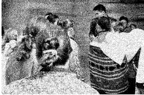
A police agent followed an AGA worker as he distributed aid to Baby Shower recipients, recording his every action. (Background deliberately blurred to obscure location.)

A field worker told me, "It's hopeless. If we continue the program, we might end up in prison. If the government wants to arrest someone, there's no shortage of made-up charges. In China, it's not easy to do good even if you want to. The government wants to watch everything. They don't want to overlook any detail, even your thoughts. They have all the money and all the manpower. That's what it means to have a strong and glorious country."