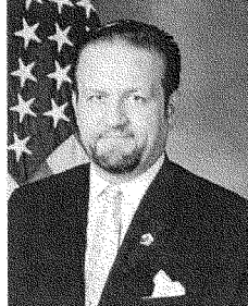
Dr. Sebastian L. v. Gorka

Dr. Sebastian Gorka teaches Irregular Warfare (Counterterrorism and Counterinsurgency) at National Defense University's College of International Security Affairs, Washington, DC and is Director of the College's Homeland Security Fellowship Program.