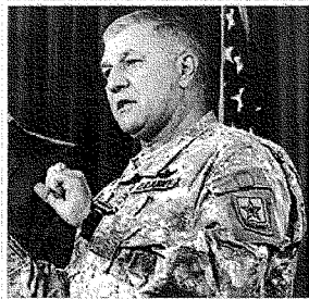
General Cody at a press conference in 2007.

Cody was born in Montpelier, Vermont, on 2 August 1950. He was commissioned a second lieutenant upon graduation in 1972 from the United States Military Academy. His military education includes completion of the Transportation Corps Officer Basic and Advanced Courses; the Aviation Maintenance Officer Course; the AH-1, AH-64, AH-64D, UH-60, and MH-60K Aircraft Qualification Courses; the Command and General Staff College, and the United States Army War College. Cody is a Master Aviator with over 5,000 hours of flight time, and is an air assault graduate.