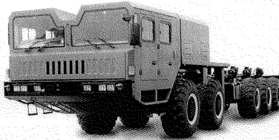
WS2600超重型越野车底盘 WS2600 super heavy-duty off-road chassis