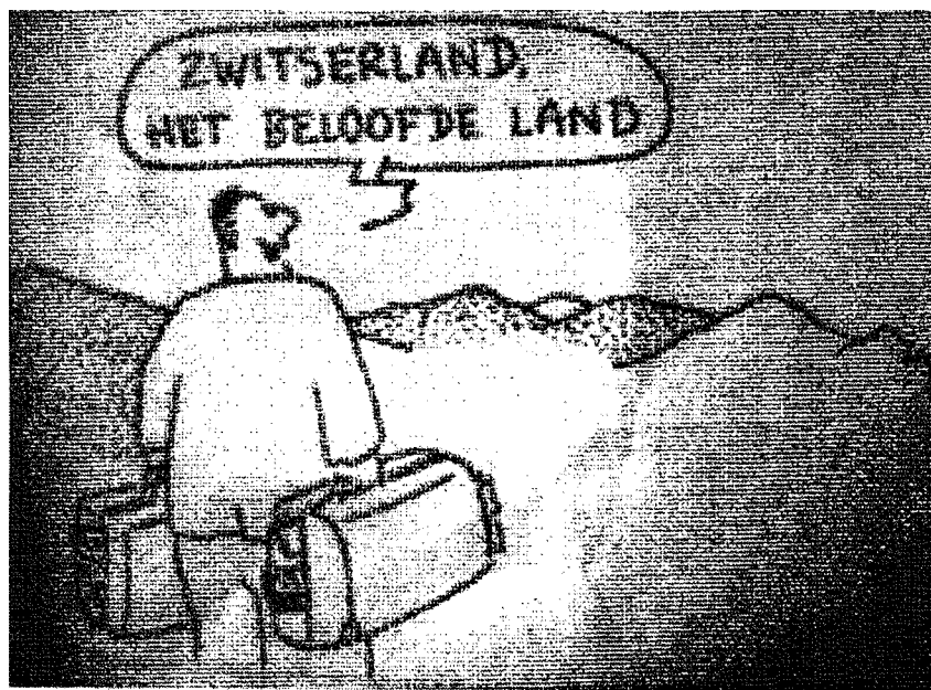
De Morgen, September 8, 2011