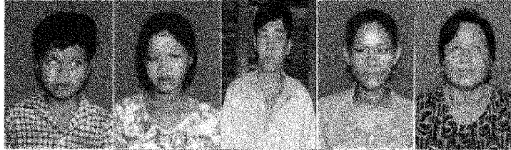
Blind victims in Soc Trang and Bac Lieu provinces

Since 2003, the blindness issues of the Khmer-Krom in Soc Trang province are still prevalent. There are thousands of Khmer-Krom people who are affected by blindness of either the left or right eye, and in some case both eyes. The main problems that cause the blindness are from contaminated drinking water from their surroundings which are largely polluted by pesticides, herbicides and fertilizers. This problem has been reported to the Vietnamese government, but the Vietnamese government has taken no actions about it because the victims are primarily Khmer-Krom.