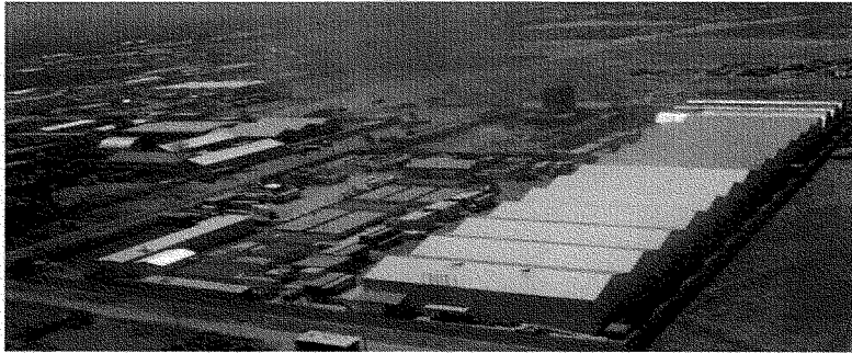
PV's warehouse in Kabul, Afghanistan

Supreme Foodservice GmbH was awarded a 60-month prime vendor contract, starting December 3, 2005. This was a fixed-price, indefinite-quantity contract and was initially valued at approximately $726.2 million. 4 At the time the contract was awarded, the PV was required to provide food and nonfood distribution support to four activities in Afghanistan—Bagram, Kabul, Salerno, and Kandahar.