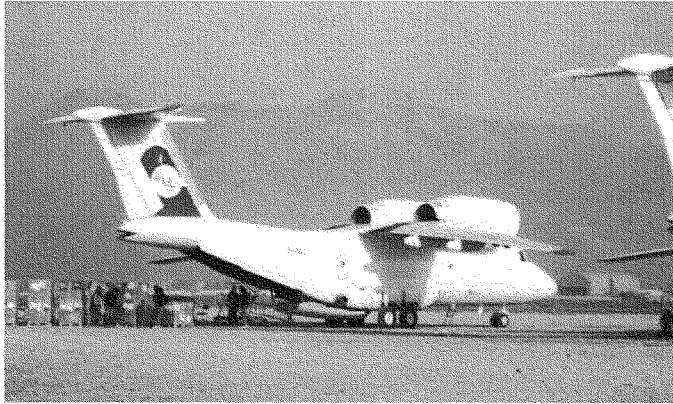
Fixed-wing aircraft used to deliver supplies.

be definitized within 180 days of the contract modification. While there are exceptions allowing heads of agencies to waive the 180-day requirement if necessary to support contingency operations, as of April 2010, subsistence contracting officials had not requested a waiver.