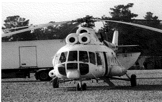
Helicopter used to deliver supplies.