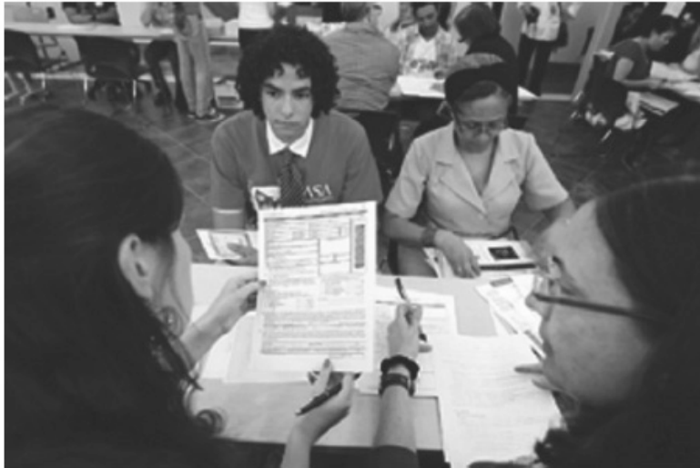
RISING TIDE: A young immigrant in Maryland applies for a work permit and deferred deportation under an Obama administration program. Hispanics now account for more than half the country's population growth.