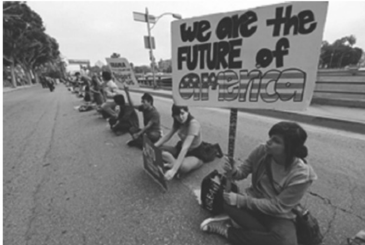
CHANGING DYNAMIC: Students block a street in Los Angeles during a June demonstration for an end to deportations. The DREAM Act would grant citizenship to many illegal immigrants brought to the United States as children, and proponents say that allowing them to stay and work would be good for the economy.

Now, though, at the moment when President Barack Obama's re-election has highlighted the growing voting power of Hispanic, Asian, and other foreign-born Americans, pro-immigration groups have begun to make an economic argument of their own.