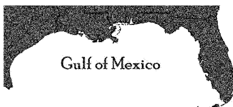
Figure 1. Gulf Coast of the US (original prepared by Nathaniel Wolf). doi:10.1371/journal.pntd.0002760.g001

with seawater or contaminated seafood [20].