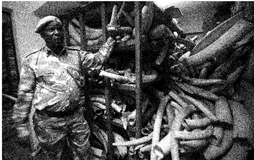
A Kenya Wildlife Services ranger shows elephant tusks intercepted from poachers during a commemoration of the 1989 ivory burning at the Nairobi National Park on July 18, 2009.