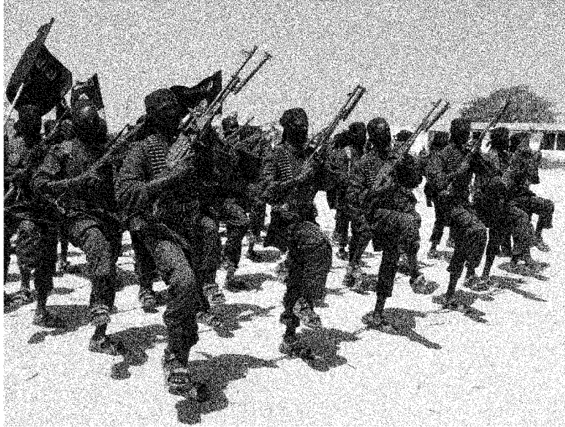
Fighters from Somali al Qaeda affiliate Al Shabaab — beneficiaries of illegal wildlife trafficking.

Authorities scrambling to implement these new US policies are confronted with major challenges. Penalties for wildlife traffickers remain weak or non-existent around the globe; powerful syndicate leaders are politically protected; and well-armed and funded networks have governments outgunned, outspent and often corrupted.