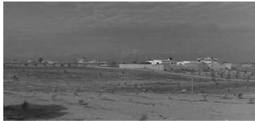
A torture camp in Sinai

ARTWORK FROM SINAI TORTURE SURVIVORS, DONE WHILE JAILED IN SINAI BY EGYPTIAN POLICE