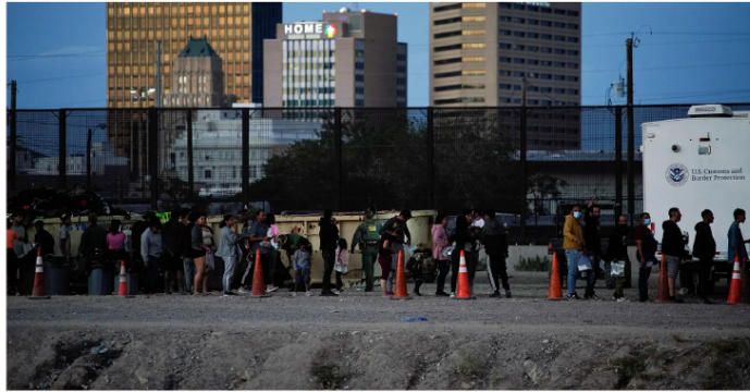
El Paso, Texas became the epicenter of the migrant crisis in the last year and currently has the most migrant apprehensions in the entire nation.