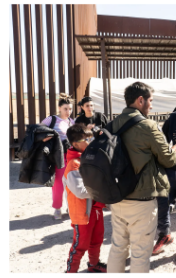
Asylum-seeking migrants from Peru being