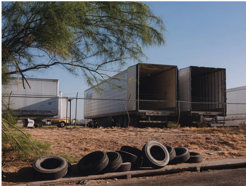
Rigs hauling migrants blend with the 20,000 trucks that travel daily on the I-35 freeway to and from Laredo, the country's busiest land port.

The enterprises have teams specializing in logistics, transportation, surveillance, stash houses and accounting — all supporting an industry whose revenues have soared to an estimated $13 billion today from $500 million in 2018, according to Homeland Security Investigations, the federal agency that investigates such cases.