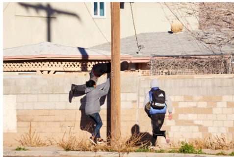
Migrants who crossed the US-Mexico Border evade capture by a Customs and Border Protection officer on Jan. 4, 2023