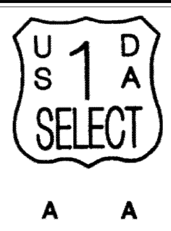
Figure 4 to paragraph (d). Official Combined Quality and Yield Grademark.

(e) Under the regulations, for yield grade identification purposes only, a shield enclosing the letters "US" on one side and "DA" on the other, and with the appropriate yield grade designation