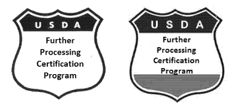
Figure 12 to paragraph (k). USDA Further Processing Certification Program Mark.

(3) Use of the "USDA Further Processing Certification Program" statement and the "USDA Further Processing Certification Program" shield shall be approved in writing by the Director prior to use by an applicant.