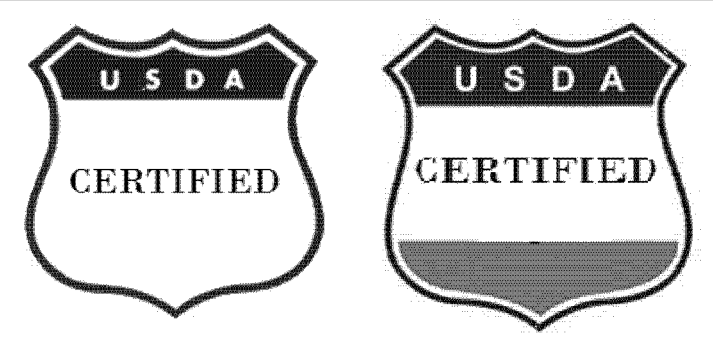
Figure 11 to paragraph (j). USDA Certified Mark.

(k) The following, as shown in Figure 12 to paragraph (k), constitutes official identification to show product or services produced under an approved USDA Further Processing Certification Program (FPCP):