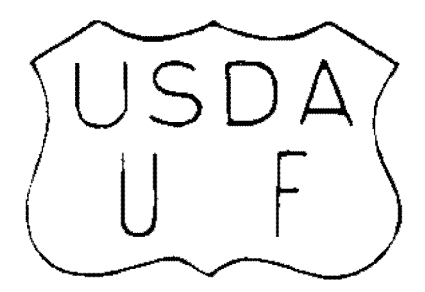
Figure 1 to Paragraph (a). Preliminary Grademark.

(a) A shield enclosing the letters "USDA" and identification letters assigned to the grader performing the service, as shown in Figure 1 to paragraph (a), constitutes a form of official identification under the regulations for preliminary grade of carcasses. This form of official identification may also be used to determine the final quality grade of carcasses; one stamp equates to "USDA Select" or "USDA Good"; two stamps placed together vertically equates to 'USDA Choice"; and three stamps placed together vertically equates to "USDA Prime."