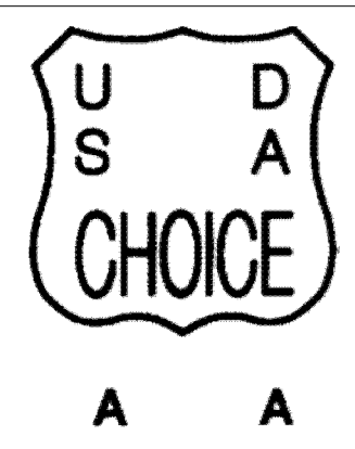
Figure 6 to paragraph (f). Official Quality Grade Identification Mark.

(g) The letters "USDA" with the appropriate grade designation "1," "2," "3," "4," "Utility," enclosed in a shield as shown in Figure 7 to paragraph (g),