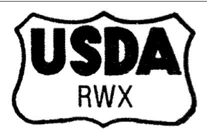
Figure 8 to paragraph (h). USDA Product Control Mark.