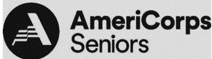
Figure 2 to paragraph (c)

(d) The Seniors Logo contains the word Seniors beneath AmeriCorps, to the right of the circle containing the A.