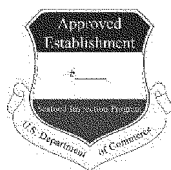
Figure 1 to Paragraph (a)(1)(ii)—USDC Approved Establishment Inspection Mark

(2) Fish and Fishery products and other marine ingredients that are (1)