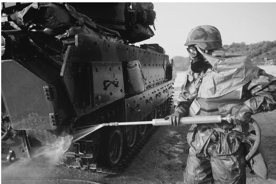
Figure 1: Soldier in Individual Protective Equipment Decontaminating a Vehicle

Individual protective equipment consists of various items, such as the individual's protective mask, gloves, and suits. According to equipment records and statements by Army officials at the units we visited, the required individual protective equipment items were on hand or had been requisitioned. We found similar conditions at the Air Force and Marine Corps units that we visited. A list of required individual protective equipment is included as appendix I. Figure 1 shows a soldier in individual protective equipment.