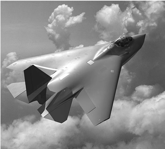
Boeing Joint Strike Fighter Design Concept