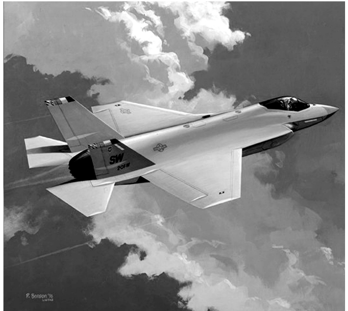
Lockheed Martin Joint Strike Fighter Design Concept