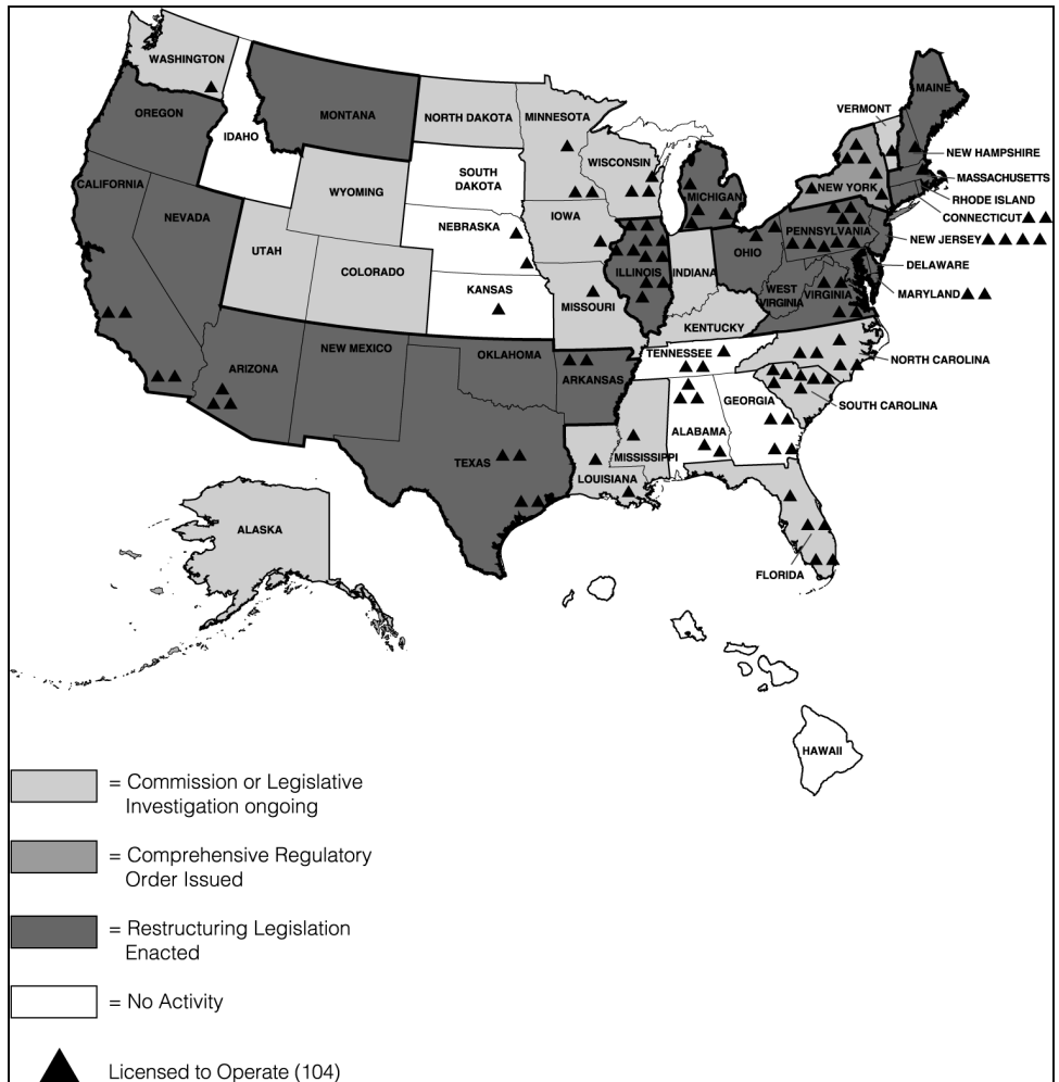
Figure 2: Map of Nuclear Power Plants in the United States and Status of Deregulation by State

Note: Includes Browns Ferry Unit 1, which has no fuel loaded and requires Commission approval to restart.