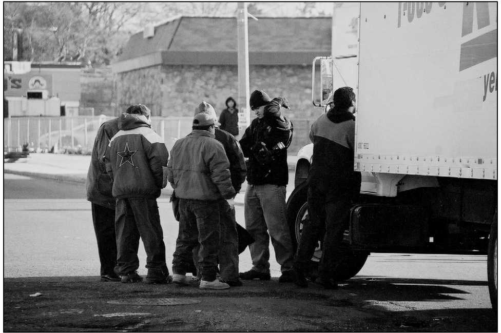
Figure 2: Day Laborers at an Employer's Truck