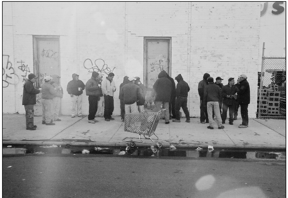
Figure 1: Day Laborers Waiting for Employment