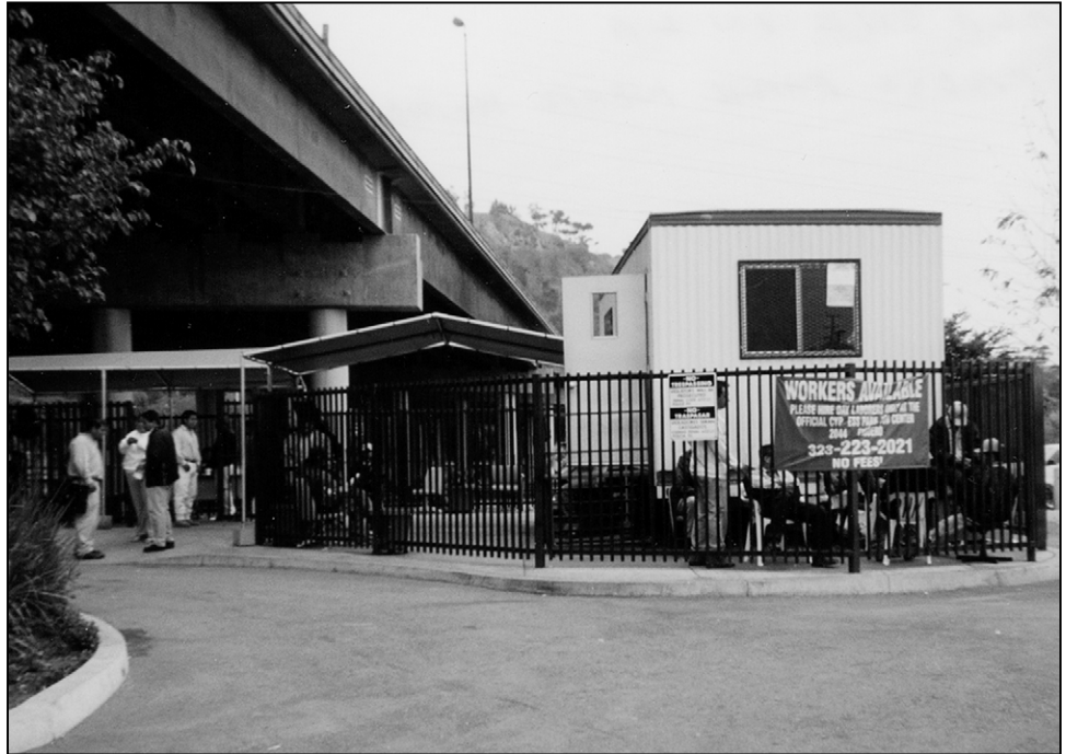
Figure 5: An Organized Day Labor Site