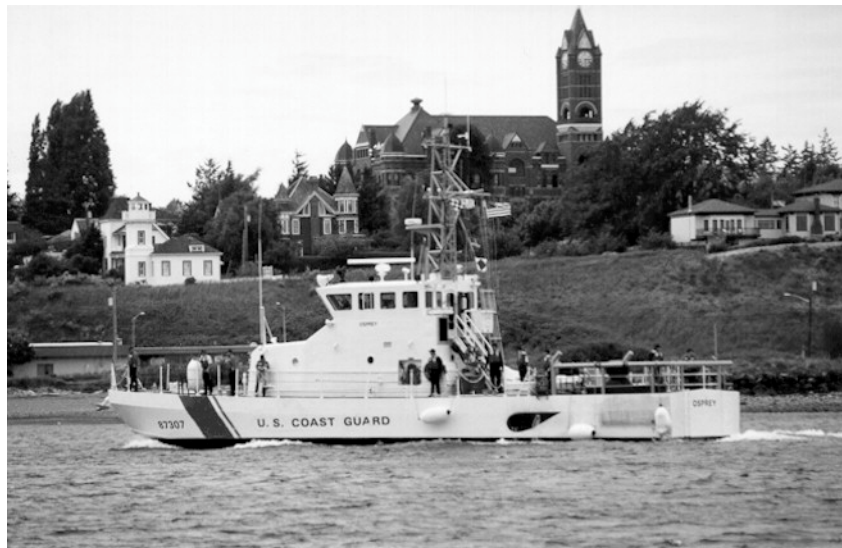
Coast Guard patrol boats like this one, formerly used mainly in activities such as intercepting drugs or illegal immigrants, were still being used extensively for harbor security patrols in mid-2002.

The Coast Guard has not yet developed a strategy for showing, even in general terms, the levels of effort it plans for its various missions in future years. Understandably, the Coast Guard's attention has been focused on assimilating added security responsibilities. However, developing a more comprehensive strategy is now important, as a way to inform the Congress about the extent to which the Coast Guard's use of its resources—cutters, boats, aircraft, and personnel—will allow it to continue meeting its many responsibilities. Also important is designing a way to keep the Congress informed about its progress in achieving this balance. The Coast Guard has considerable data from which to develop progress reports, but this information is currently in disparate forms and documents.