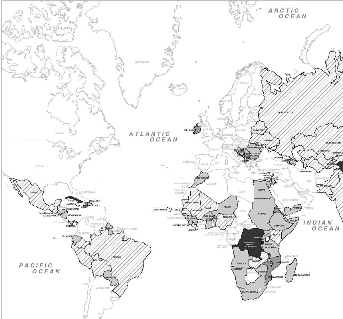
Figure 1: Countries That Have and Do Not Have Agreements Containing Prohibitions against Taxation