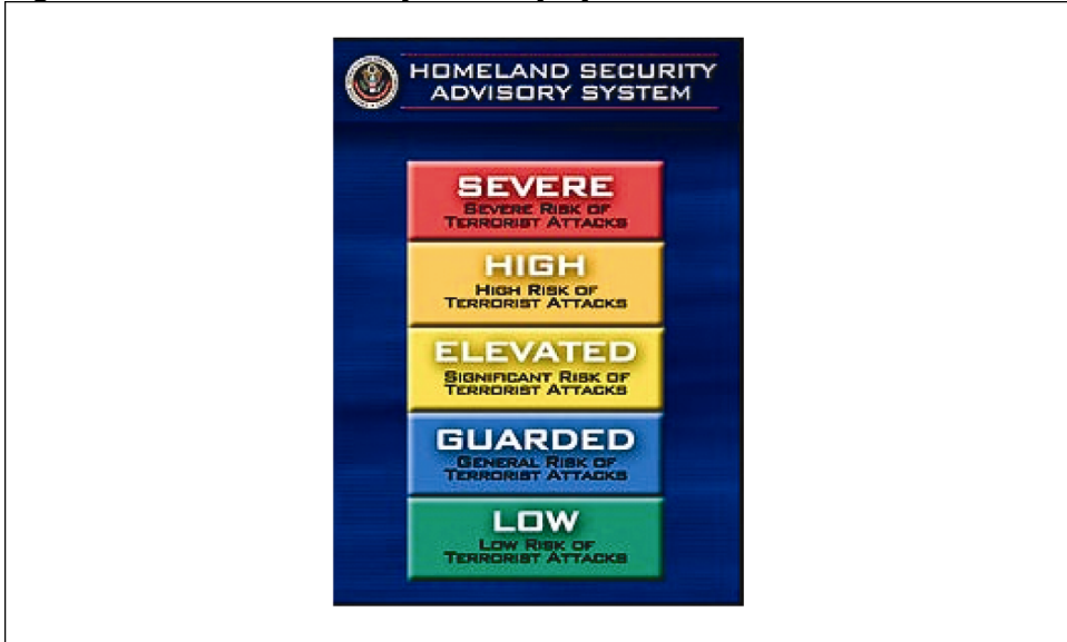
Figure 1: Homeland Security Advisory System