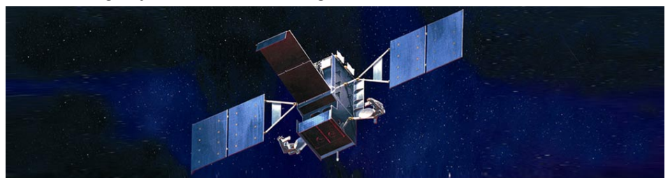
Illustration of geosynchronous earth-orbiting satellite

However, the restructuring did not fully address some long-standing problems identified by the Independent Review Team. As a result, the program continues to be at substantial risk of cost and schedule increases. Key among the problems is the program’s history of moving forward without sufficient knowledge to ensure that the product design is stable and meets performance requirements and that adequate resources are available. For example, a year before the restructuring, the program passed its critical design review with only 50 percent of its design drawings completed, compared to 90 percent as recommended by best practices. Consequently, several design modifications were necessary, including 39 to the first of two infrared sensors to reduce excessive noise created by electromagnetic interference—a threat to the host satellite’s functionality—delaying delivery of the sensor by 10 months or more. Software development underlies most of the top 10 program risks, according to the contractor and the SBIRS High Program Office. For example, testing of the first infrared sensor revealed several deficiencies in the flight software involving the sensor’s ability to maintain earth coverage and track missiles while orbiting the earth. Program officials stated that they are coordinating the delivery of the first sensor with the delivery of the host satellite to mitigate any schedule impacts, but they agreed that these delays put the remaining SBIRS High schedule at risk.