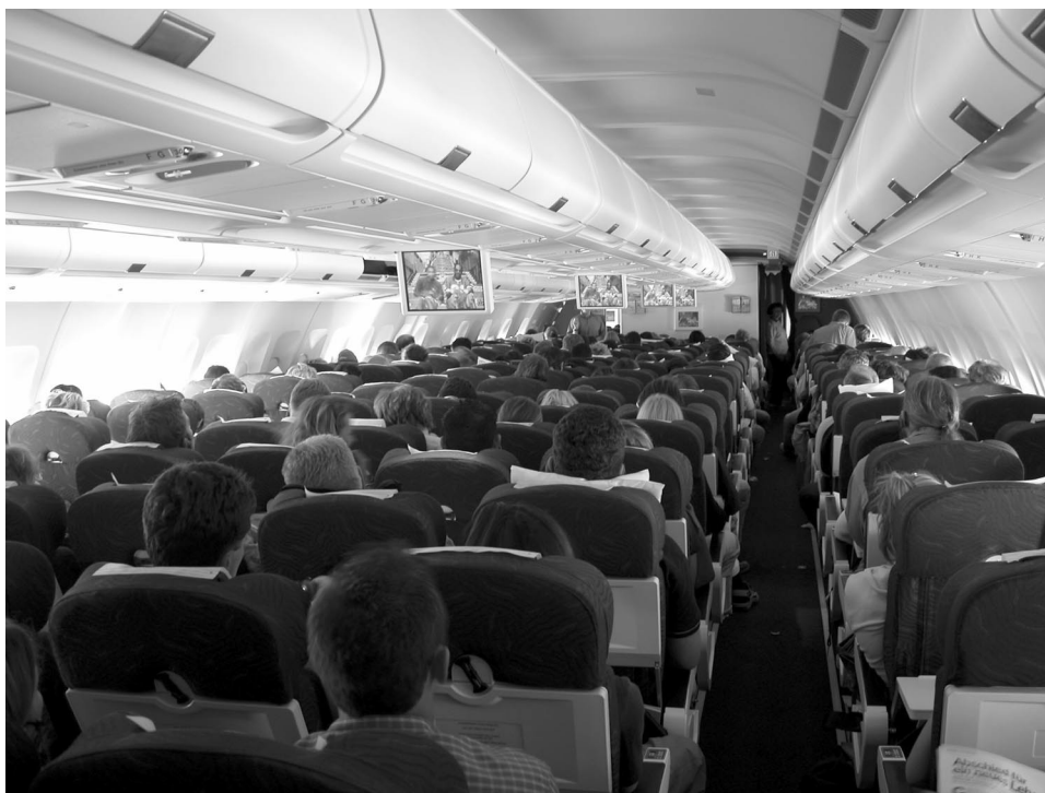
Figure 1: Passenger Cabin of Commercial Airliner