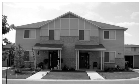
Fort Hood, Texas