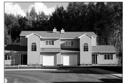
Elmendorf Air Force Base, Alaska