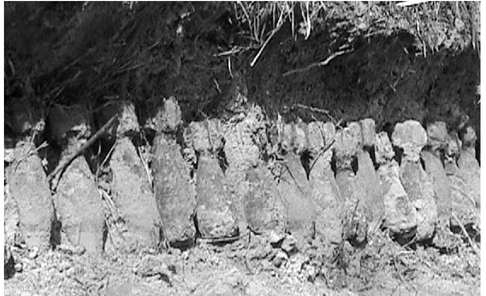
Figure 2: Discarded Military Munitions Discovered on a Closed Range