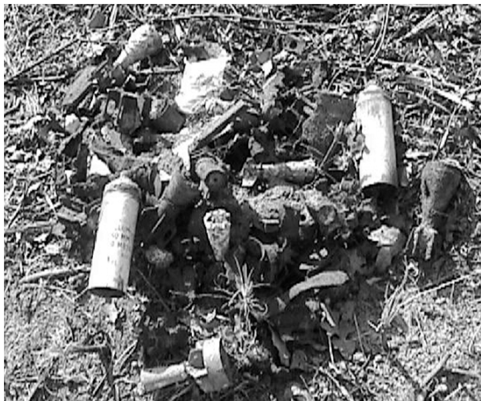
Figure 3: Munitions Debris, Including Ordnance, Collected during Range Clearance