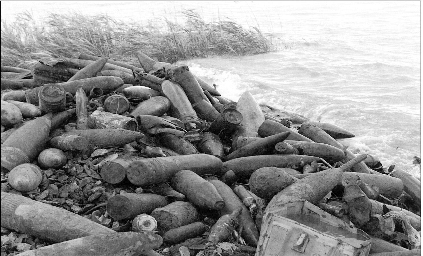
Figure 1: Discarded Munitions on an Operational Range That Were Later Uncovered by Erosion