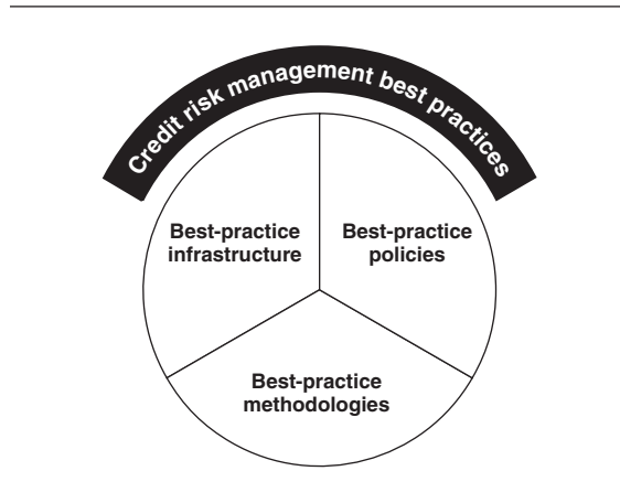
Figure 1: Best-Practices Risk Management Framework