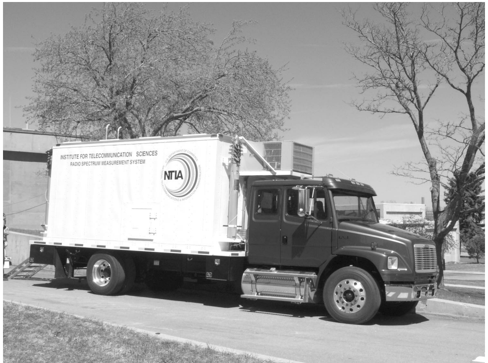
Figure 1: NTIA's Spectrum Measurement Van