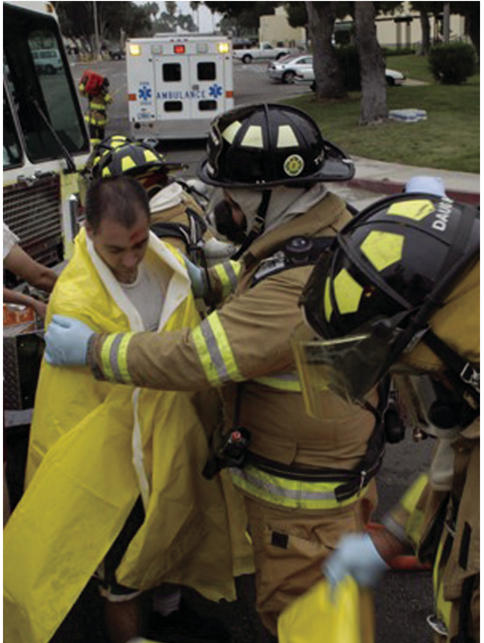
Figure 2: Emergency Personnel Assist Individual in Chemical/Biological Exercise