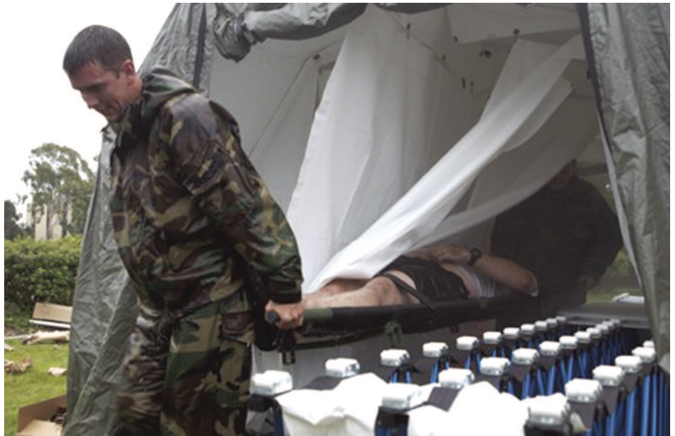
Figure 1: Decontamination Operation during Installation Exercise