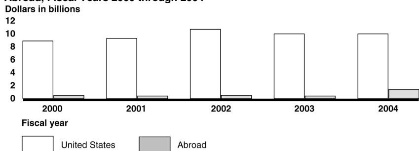
Federal Agencies' Estimated Obligations for Freshwater Programs in the United States and Abroad, Fiscal Years 2000 through 2004