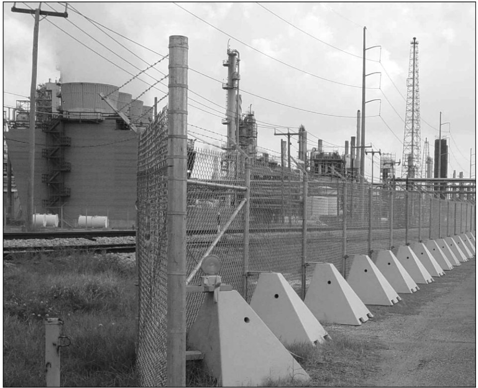
Figure 1: A Chemical Facility