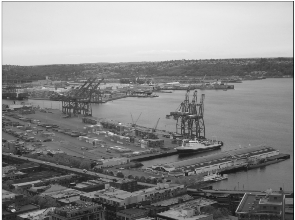
Figure 3: A Maritime Facility