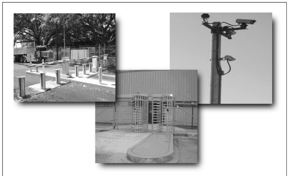
Figure 4: Examples of Perimeter and Access Controls Chemical Facilities Reported Implementing