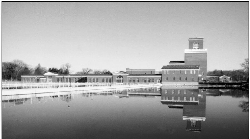
Figure 2: A Community Water System

(see app. II for more details on the number of community water systems in the United States). Community water systems vary by size and other factors but most typically include a supply source, such as a reservoir; a treatment facility, which stores and uses chemicals, such as chlorine, to eliminate biological contaminants; and a distribution system, which includes water towers, piping grids, pumps, and other components to deliver treated water to consumers. Community water systems often contain thousands of miles of pipes and numerous access points that can be vulnerable to terrorist attack. Figure 2 reflects a community water system.